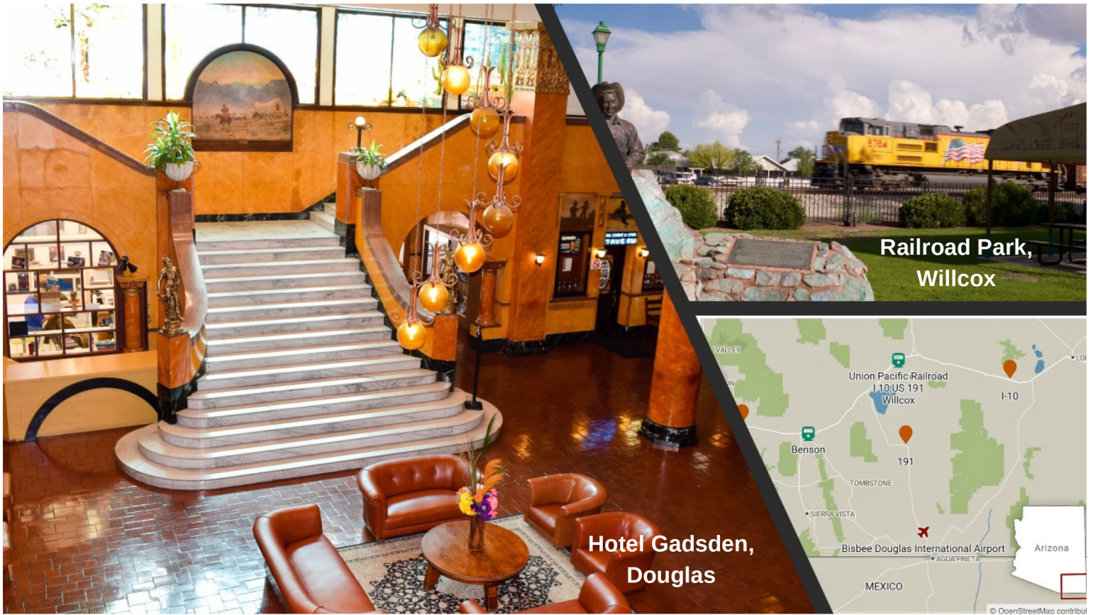
Railroad Park, Willcox