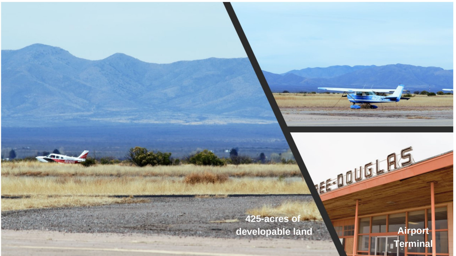
425-acres of developable land